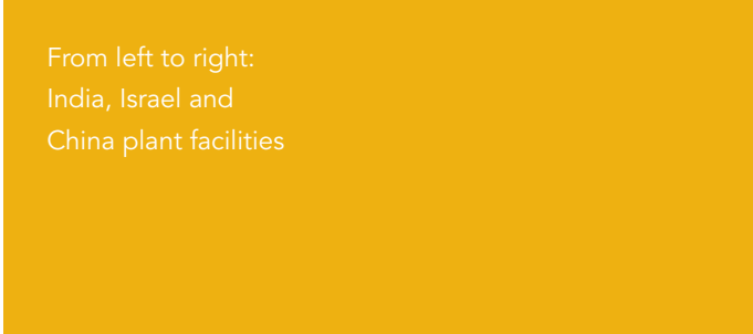
From left to right: India, Israel and China plant facilities

The loss of US$4.3 million (excluding discontinued operations) primarily resulted from impairment losses on the China facility of US$2.0 million and operating losses in India of US$1.8 million. To mitigate the losses, head office in Singapore was reorganised, reducing costs by US$0.6 million or 17% from preceding year.